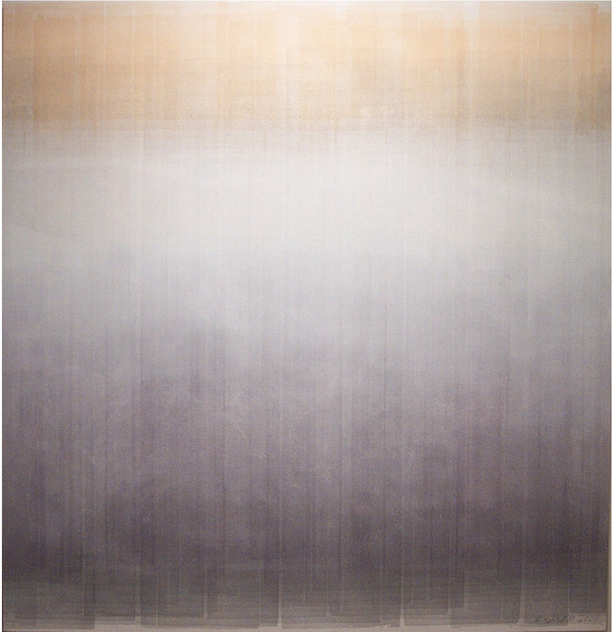
Shen Chen (b.1955) - Untitled No. 0121-06, 2006, Acrylic on canvas, 48 x 46 in