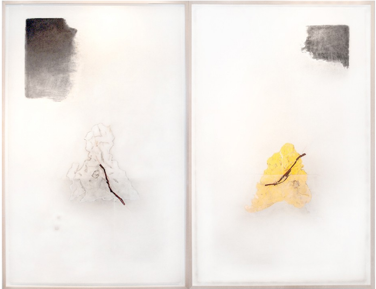
He Sai Bang (b.1959) - Golden Stone & Silver Stone, 2006, Mixed media on paper, Each: 61 x 39.375 in (A pair)