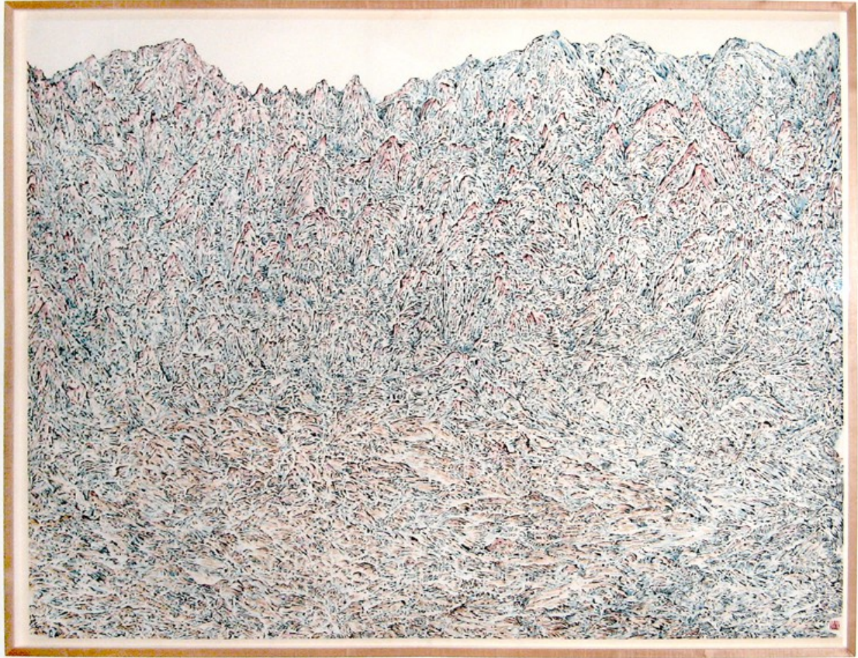
Zeng Xiaojun (b.1954) - Metamorphosis , 1999, Color and ink on paper, 56.25 x 71.5 in