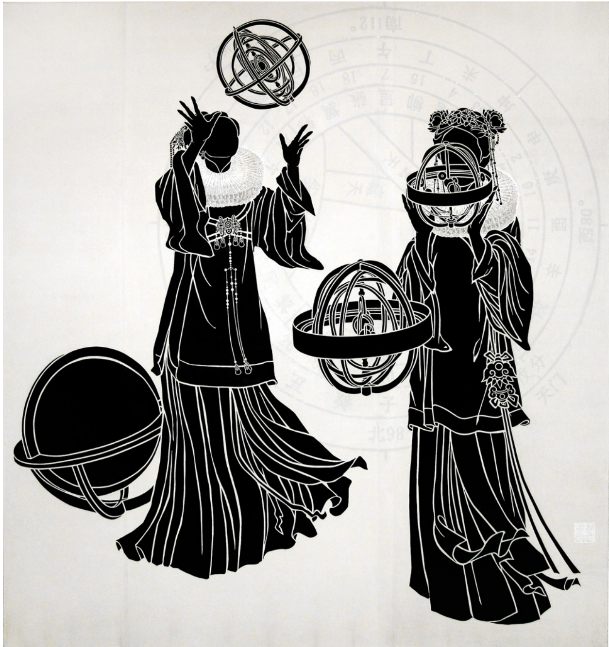
Annsya Ng - Celestial and Terrestrial Evolution, 2012, Acrylic on silk, mixed medium, 64 x 60 in